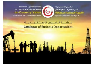
Catalogue of opportunities